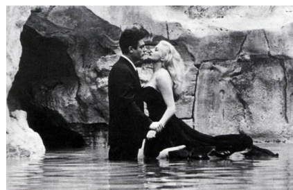
Above: The legendary scene in the Fontana di Trevi with Marcello Mastroianni and Anita Ekberg in La Dolce Vita . Right: Giulietta Masina in Le Notti di Cabiria .

With this film, full of memories of his childhood in Rimini and of extravagant characters, Fellini became known abroad. In 1954, with La strada , one of his most tender and poetic films, with wife Giulietta Masina in the role of the unforgettable Gelsomina, also comes the first Oscar. In 1957 Fellini won his second Oscar with The Nights of Cabiria , also with Masina in the role of the protagonist. With La dolce vita (1959), Palme d'Or at the Cannes Film Festival, Fellini realises his masterpiece, a film completely free from traditional narrative structures that tells in no uncertain terms the crisis of values in modern society and, precisely for this reason, attracts heavy criticism from ecclesiastical circles.