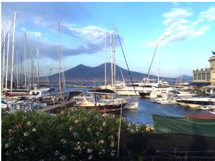
Mount Vesuvius, Naples, seen from Castel dell'Ovo for the 10th day of the challenge (see page 4)